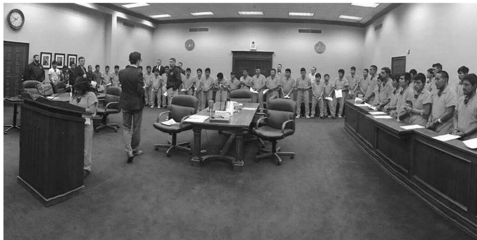
FIGURE 2. PHOTOGRAPH OF AN OPERATION STREAMLINE PROCEEDING 67

Different courthouses have allowed varying numbers of defendants to be processed at once in a Streamline hearing. In Tucson, the maximum number of defendants per hearing was set at seventy-five, while in Del Rio it could get up to eighty, and in Las Cruces it periodically reached 100. 68 Some magistrate judges have even bragged about how quickly they conduct Streamline hearings. Magistrate Judge Bernardo Velasco of Arizona told the New York Times that his record was completing seventy cases in thirty minutes. 69