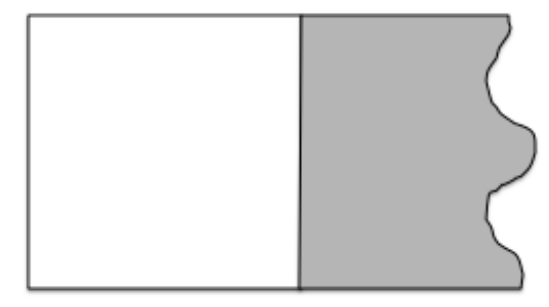
White adversely possesses the entirety of Gray, leaving the eastern irregular border unchanged.

Consequently, adverse possession has the potential to alter the general level of regularity in land boundaries with every dispute. In the long run, adverse possession may contribute to a general trend toward or away from regularity. As outlined in the next section, the relative regularity of parcel boundaries has direct effects on land value, transaction costs, and property dispute frequency.